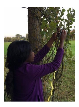
Fig. 3 Taking of FBA input data.

A destructive method was however used on 18 Poplar trees to determine the form factor, density and biomass of the trees. Wood samples were taken from 18 Poplar trees to determine the density (Fig. 3).