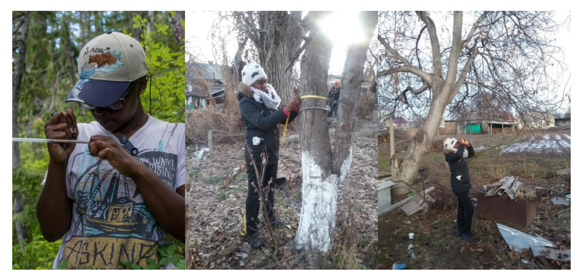
Fig. 2 Extraction of tree cores; taking of FBA Input Parameters; measuring of tree height.

The tree rings were measured using dendrochronological techniques to assess the tree age. The increment cores were then air dried and sanded with a sandpaper. The procedure continued until tree ring boundaries were clearly visible visually and with a microscope. All collected data in the field were analyzed mainly through computer programme using Excel. The tree age was estimated as one annual ring equal to one year.