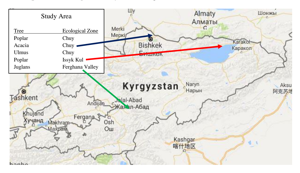
Fig. 1 Map of study area.